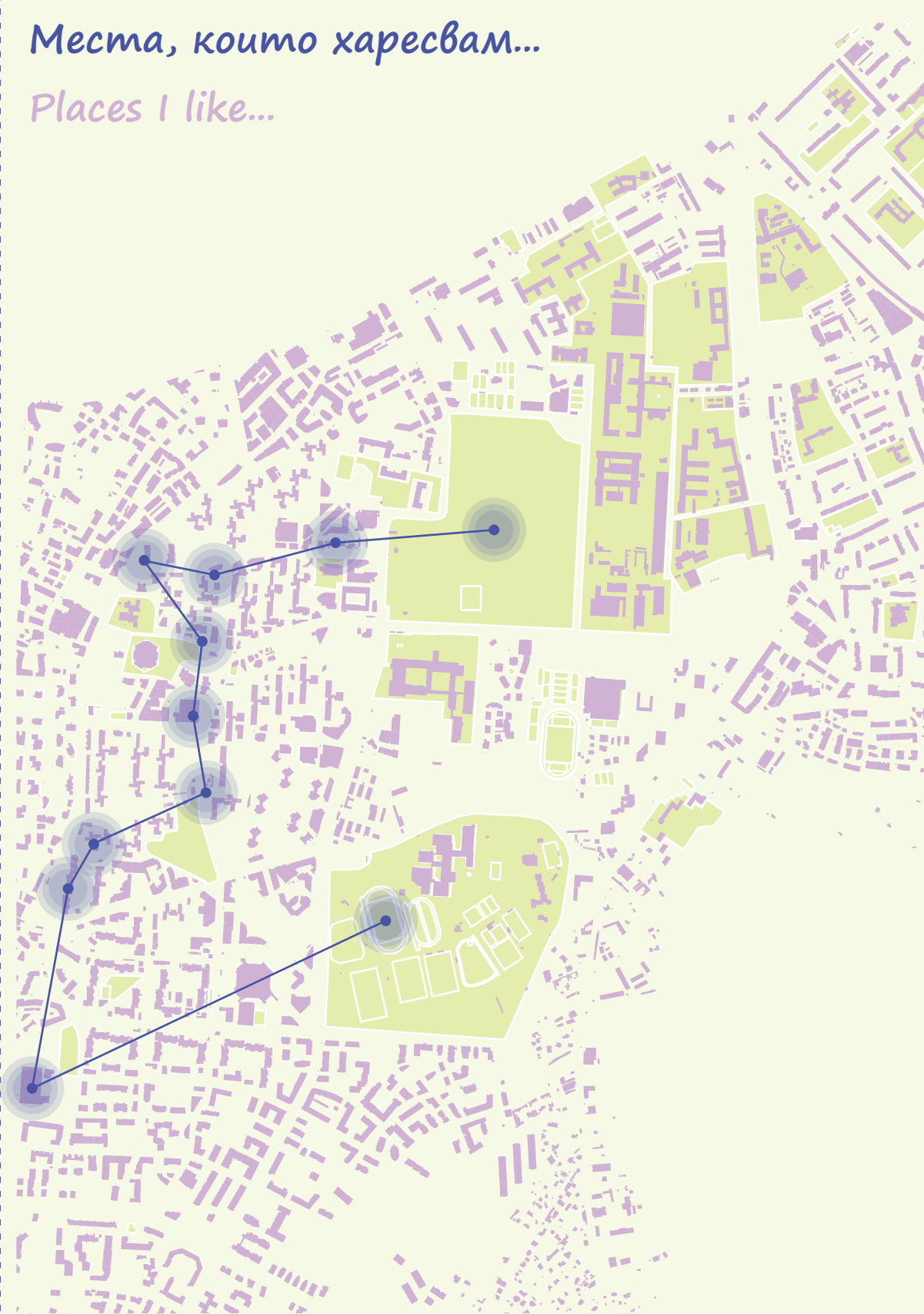
Places I like...