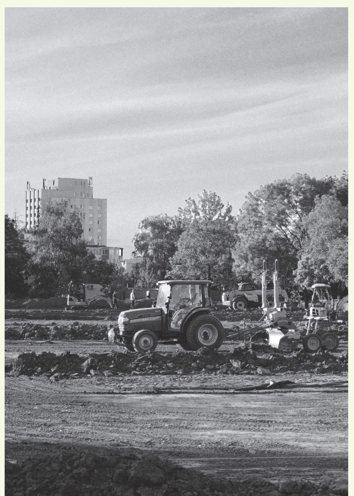
Места, които отбягвам...