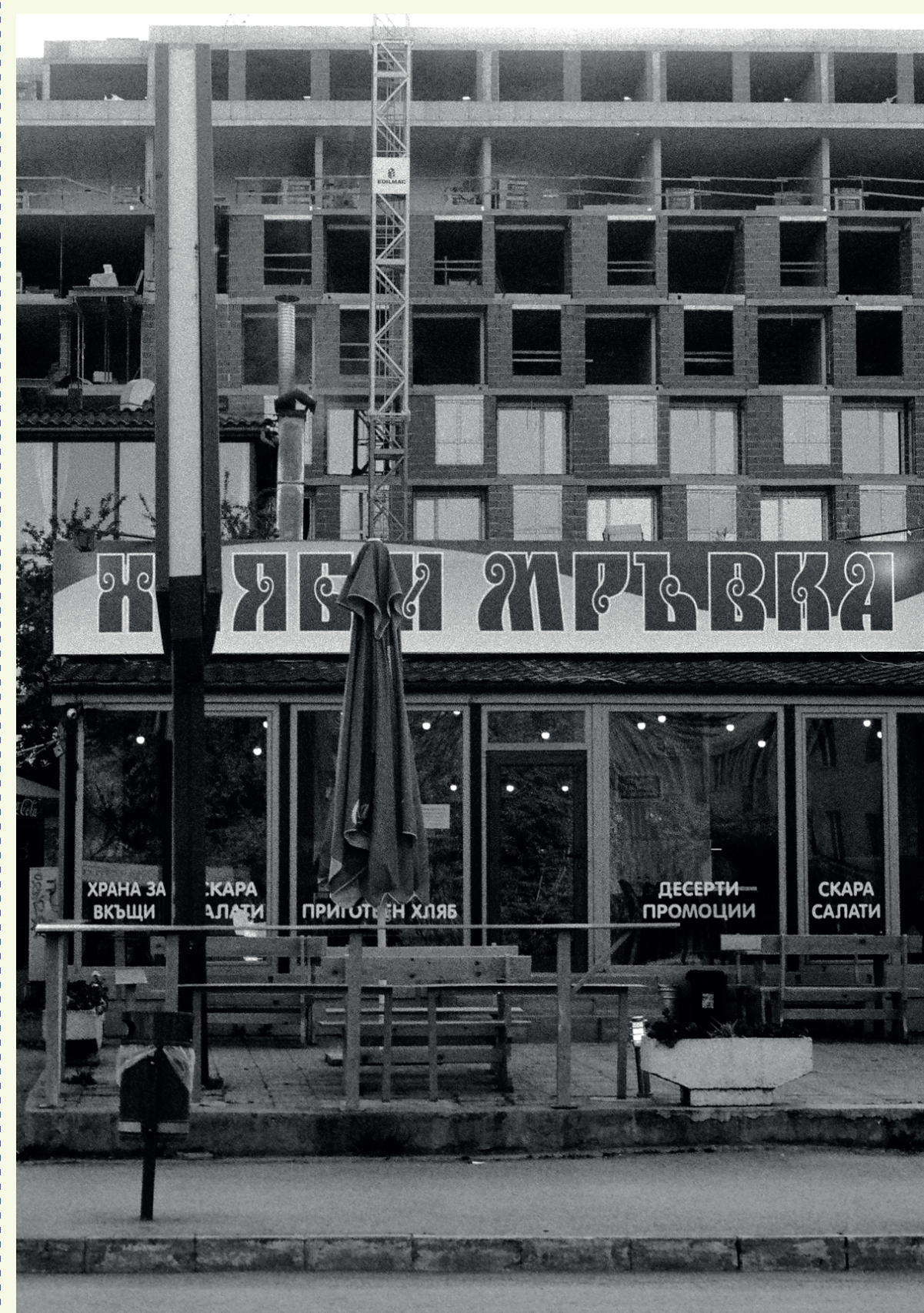
Places I avoid...